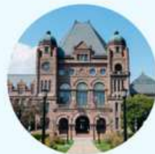
Government of Ontario

Municipalities determine investments required to build thriving communities